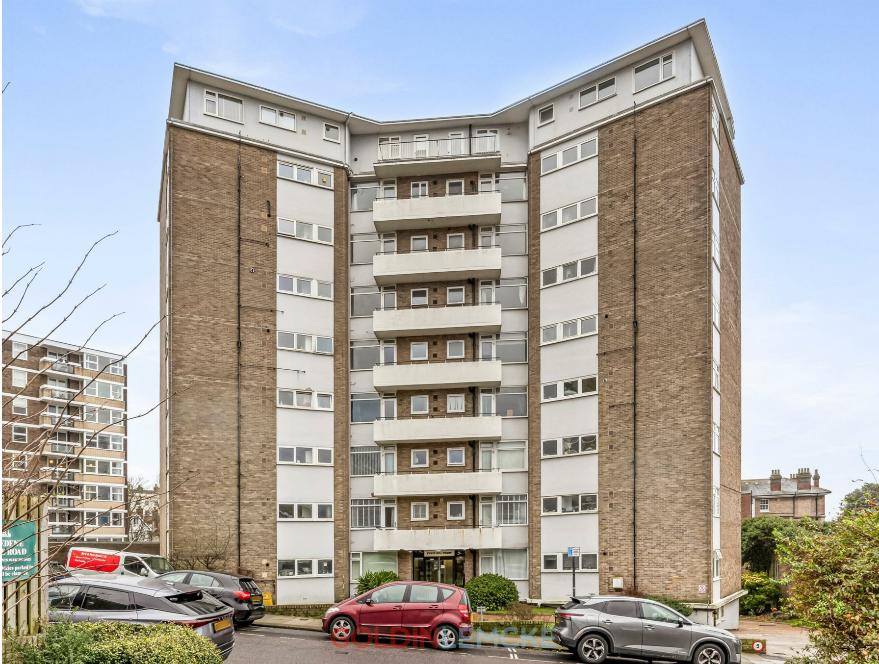
Furze Hill Court, Furze Hill, Hove, BN3 1PG £350,000